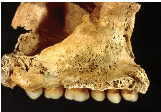
Figure 1. Early stage rhinomaxillary changes in leprosy: left maxilla showing periostitis on the nasal surface (Püspökladány, 10-11 th centuries AD, Grave No 503, Adult Female).