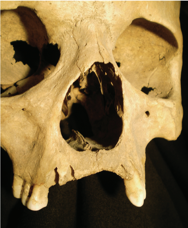
Figure 4. Facies leprosa: rhinomaxillary changes (Szentcs-Kistóke, 4-7 th century AD, Grave No 11, Adult Female).

(Fig. 4) comes from an archaeological excavation from the first half of the 20 th century and has been dated to the relatively large 'Migration Period' (Szentcs-Kistóke series, around 4 th -7 th centuries AD). The morphological aspects of the rhinomaxillary changes are characteristic of a facies leprosa . Unfortunately, we do not possess any postcranial bones. Complementary studies and a more precise dating should be necessary. At this moment, we can only conclude that this is a potential early-medieval leprosy case, which may be anterior to the oldest Avar Age cases in Hungary.