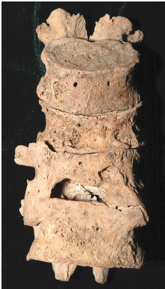
Figure 6. Vertebral fusion in spinal TB (Szeged-Kiskundorozsma, 7 th century AD, Grave No 176, Senium Male).