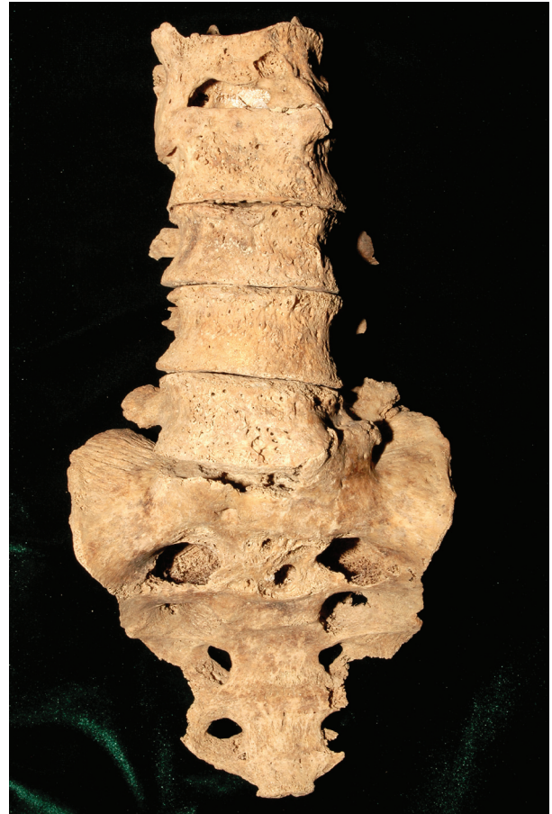
Figure 5. Multifocal spinal TB: lytic lesions, new bone formations, vertebral fusions, traces of cold abscess (Szeged-Kiskundorozsma, 7 th century AD, Grave No 176, Senium Male).

Following the chronology of the archaeological excavations, the paleopathological study of the 16-17 th century Bácsalmás-Óalmás anthropological series was carried out in several steps. The first part of the series have already presented a high prevalence of early stage TB cases (e.g. Molnár and Pálfi 1994; Pálfi and Ardagna 2002; Maczel 2003; Fig. 7, 8). Ancient DNA analysis by Haas and co-workers had proved the relationship between the frequent early stage alterations and the TB infection (Haas et al 1999, 2000a). The study of