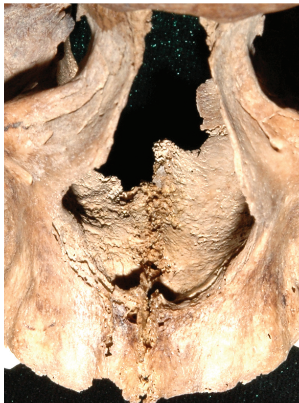
Figure 3. Rhinomaxillary changes in leprosy (Szeged-Kiskundorozsma, 7 th century AD, Grave No 517, Adult Male).

The paleopathological study of mycobacterial diseases (tuberculosis and leprosy) has furnished several important new results from the Szeged Collection. Among others, we have to mention the 2005-2006 results by Donoghue and collaborators: two of the examined Hungarian cases from the Püspökladány series (10 th -11 th centuries AD) with typi-