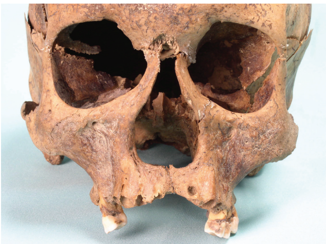
Figure 2. Facies leprosa: erosion of nasal margins and loss of anterior nasal spine (Szeged-Kiskundorozsma, 7 th century AD, Grave No 271, Mature Male).

material from the medieval Szeged Castle excavations (Ósz et al. 2006, 2009a). In these cases, the macro-morphological diagnosis was backed up by paleoradiological and paleohistological analyses; furthermore, the Pre-Columbian origin was suggested both by archaeological and radiocarbon dating (see more details in the present volume of Acta Biologica Szegediensis , Ósz et al. 2009b).