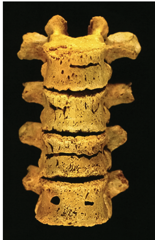
Figure 8. Early stage TB: hypervascularisation and resorptive lesions on the ventral bodies of thoracic vertebrae periosteal (Bácsalmás-Óalmás, Grave No 115, Juvenile Male).

cases in our collections. As for treponematosi, due to the new discoveries from Szeged, its Pre-Columbian presence in Central Europe is not a question any more. Unfortunately, the low number of cases excludes all attempts of epidemiological reconstruction.